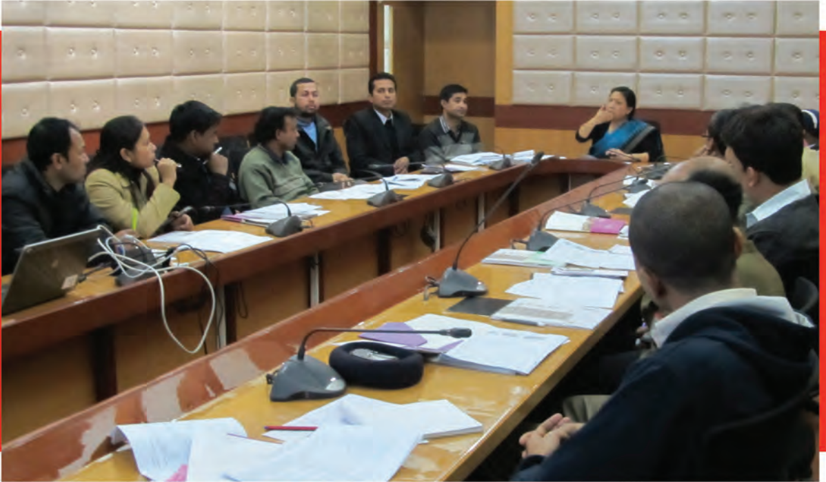
Discussions with the NGOs, Civil Defence, AFSO on the execution of the Programme

Feedback from State Fire Service Organisation which conducted Fire Safety Assessment in the apartment buildings