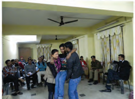
Sensitization programme being conducted at various Apartment Societies